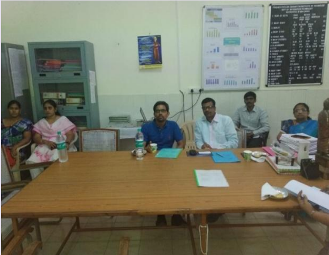
BOS Meeting on 01.06.2019