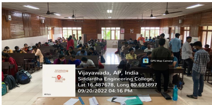
Student coordinators interacting with all the members of the club.

These are the few pictures which shows that how enthusiastic towards the club activity.