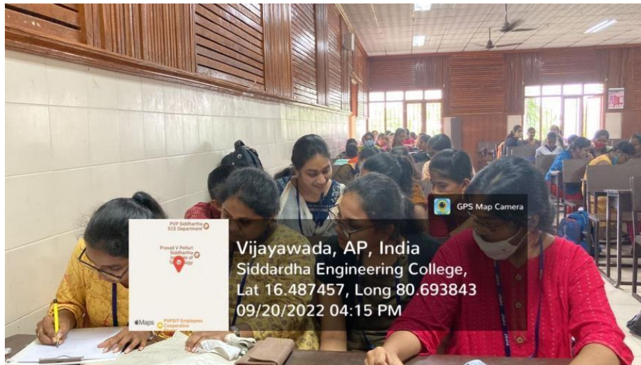
Students discussing and participating actively in the event.