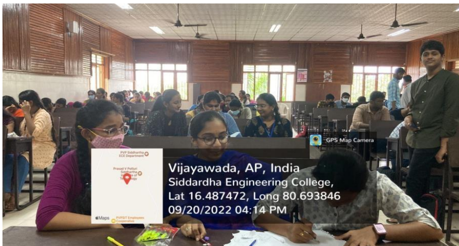
Active participation of the students