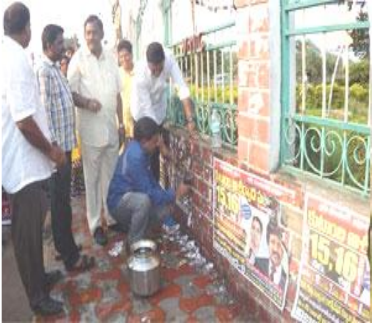
Sri. Koneru Sridhar, Mayor, Vijayawada, inaugurating the event

65 NSS Volunteers have participated in Transforming Vijayawada City Campaign, organized at DRR Municipal Indoor Stadium, Vijayawada on 22-07-2016 and 25-07-2016. The Campaign is aimed at making the City poster-free, ad-free. The volunteers have painted the walls with colourful pictures and transformed the city.