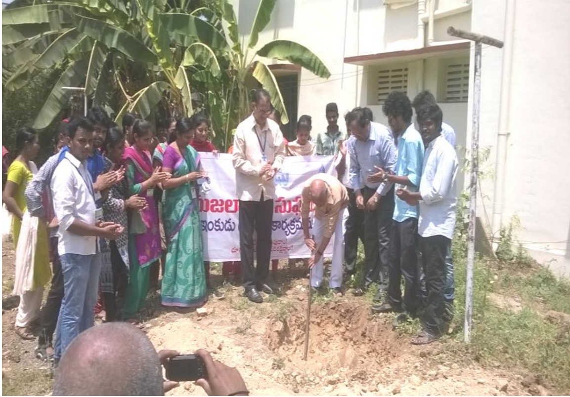
Guests with volunteers