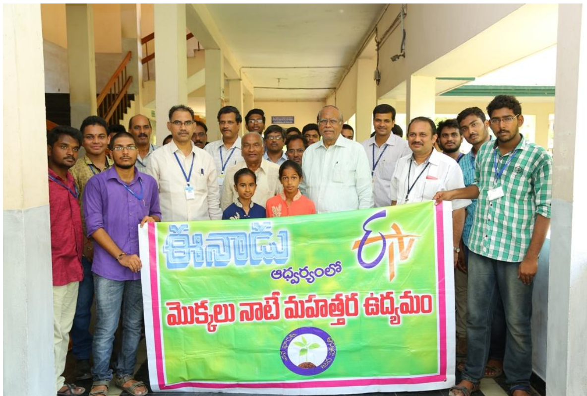
Guests inaugurating the event