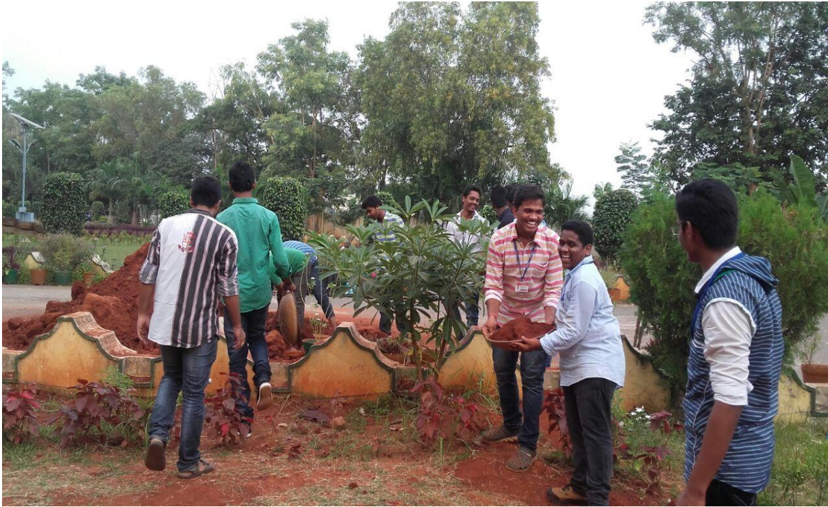
Volunteers bending their back to beauty the garden