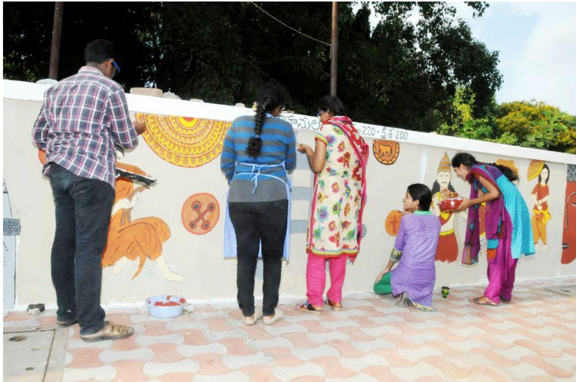
Students painting the walls with beautiful colours