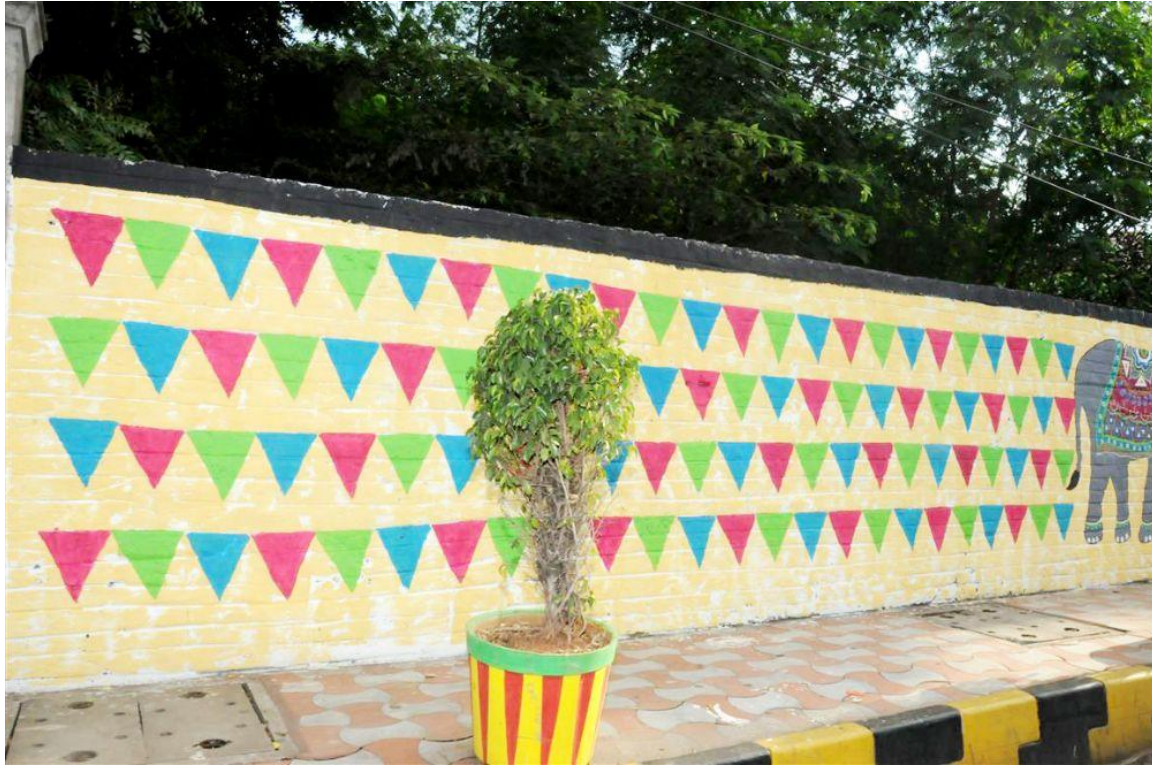
The transformed walls of our city