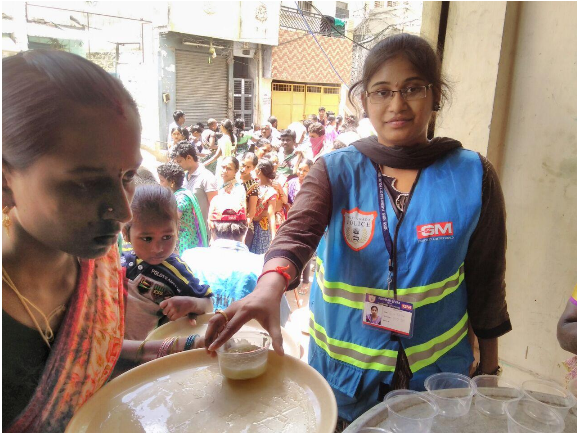
Our proud team of volunteers