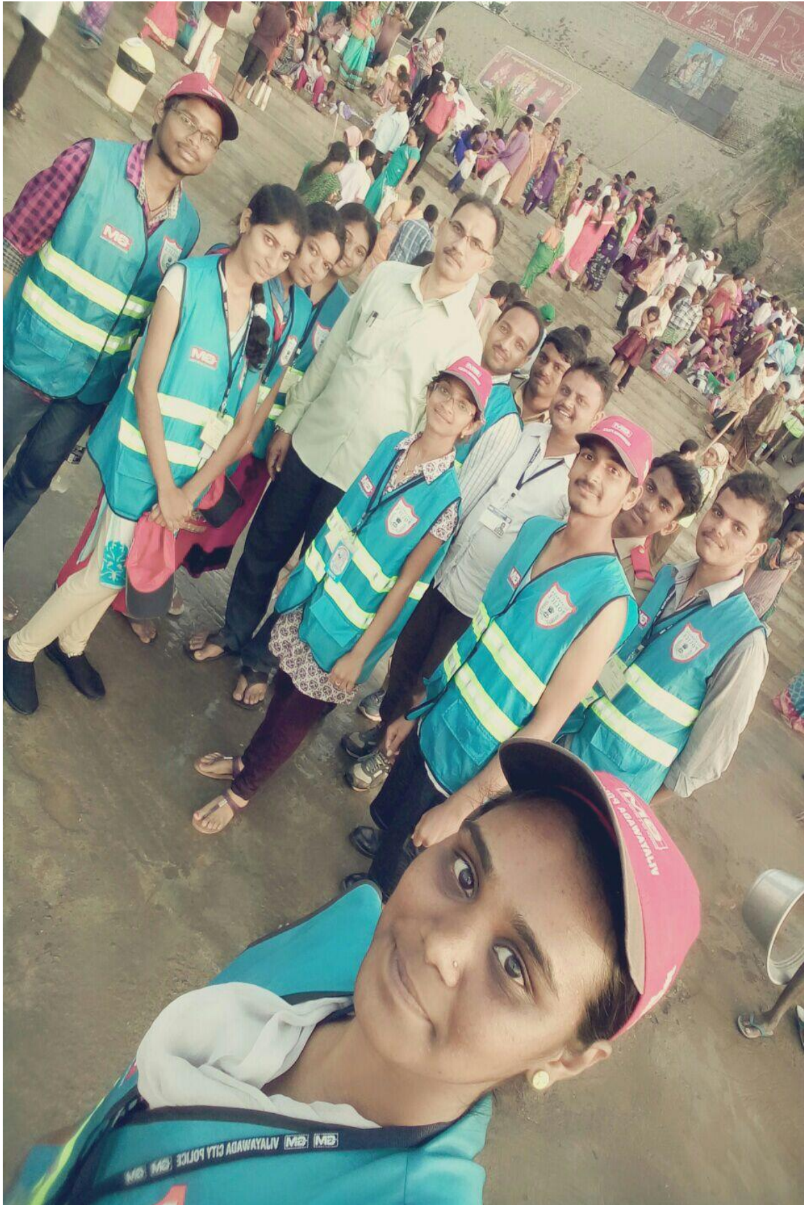
Volunteers with our Principal at Durga Ghat