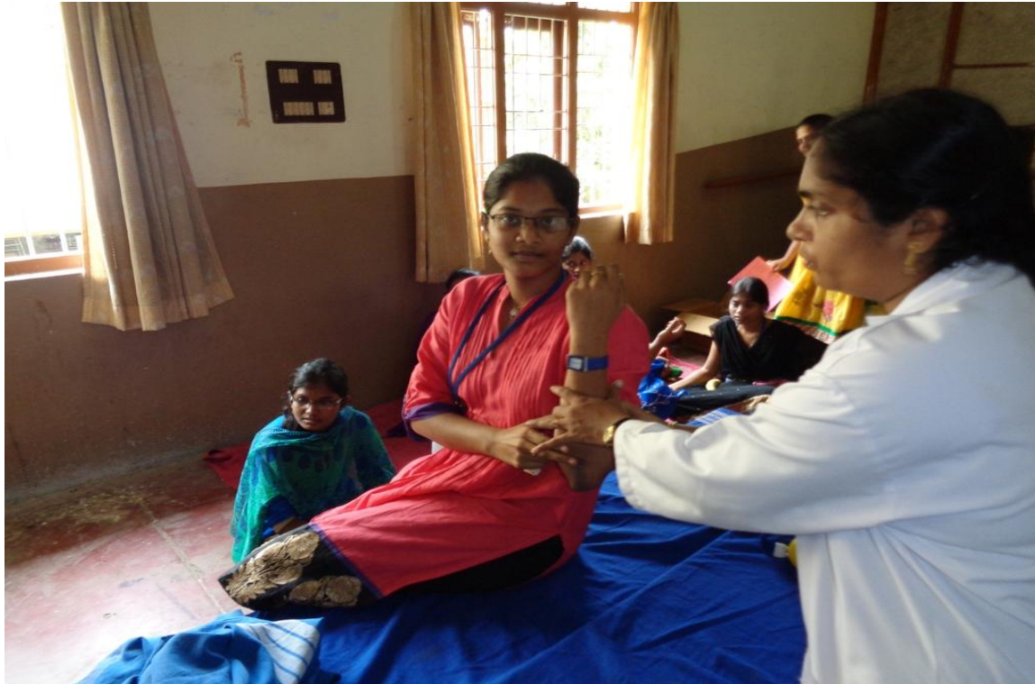
Girl students participating with great enthusiasm..