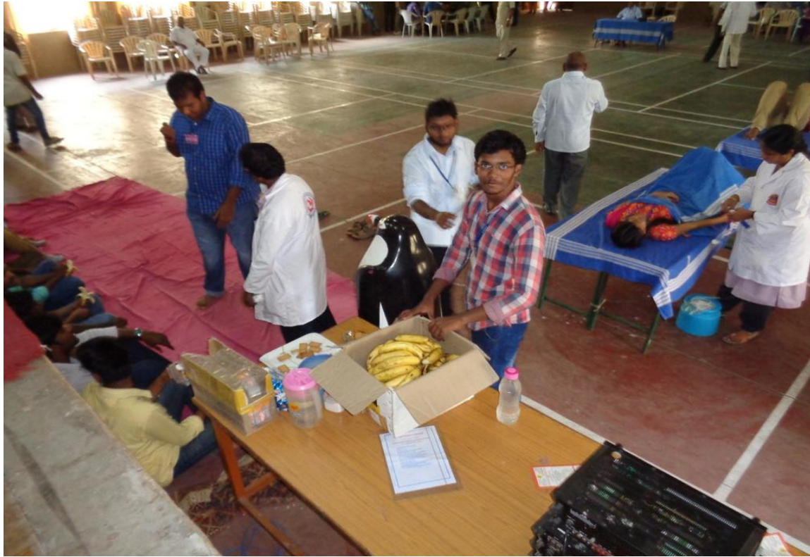
Scenes of donation during the camp