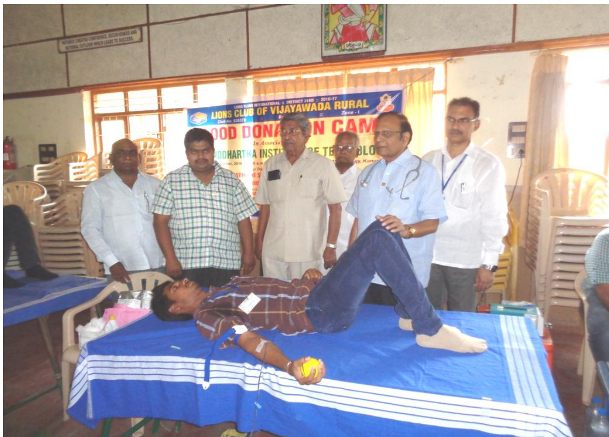
Guests greeting the donors