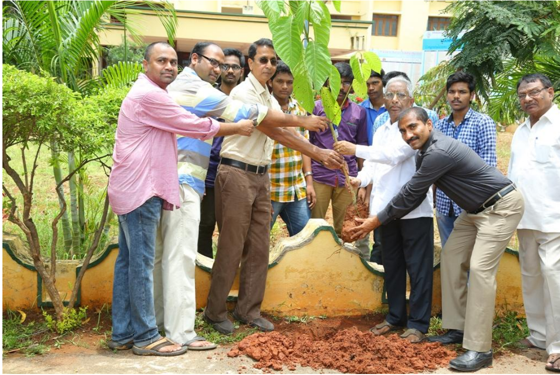
Respected guests joining hands in Green Environment