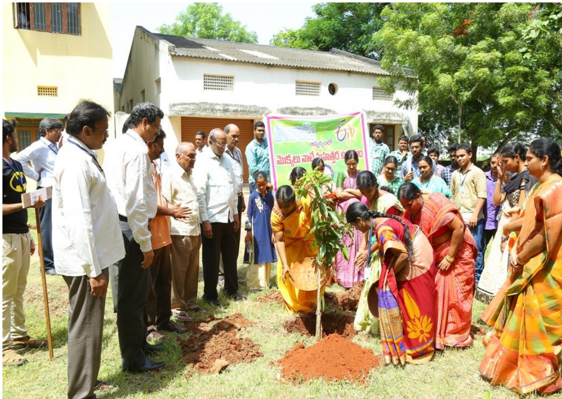
Staff at the event, encouraged by our beloved Convenor