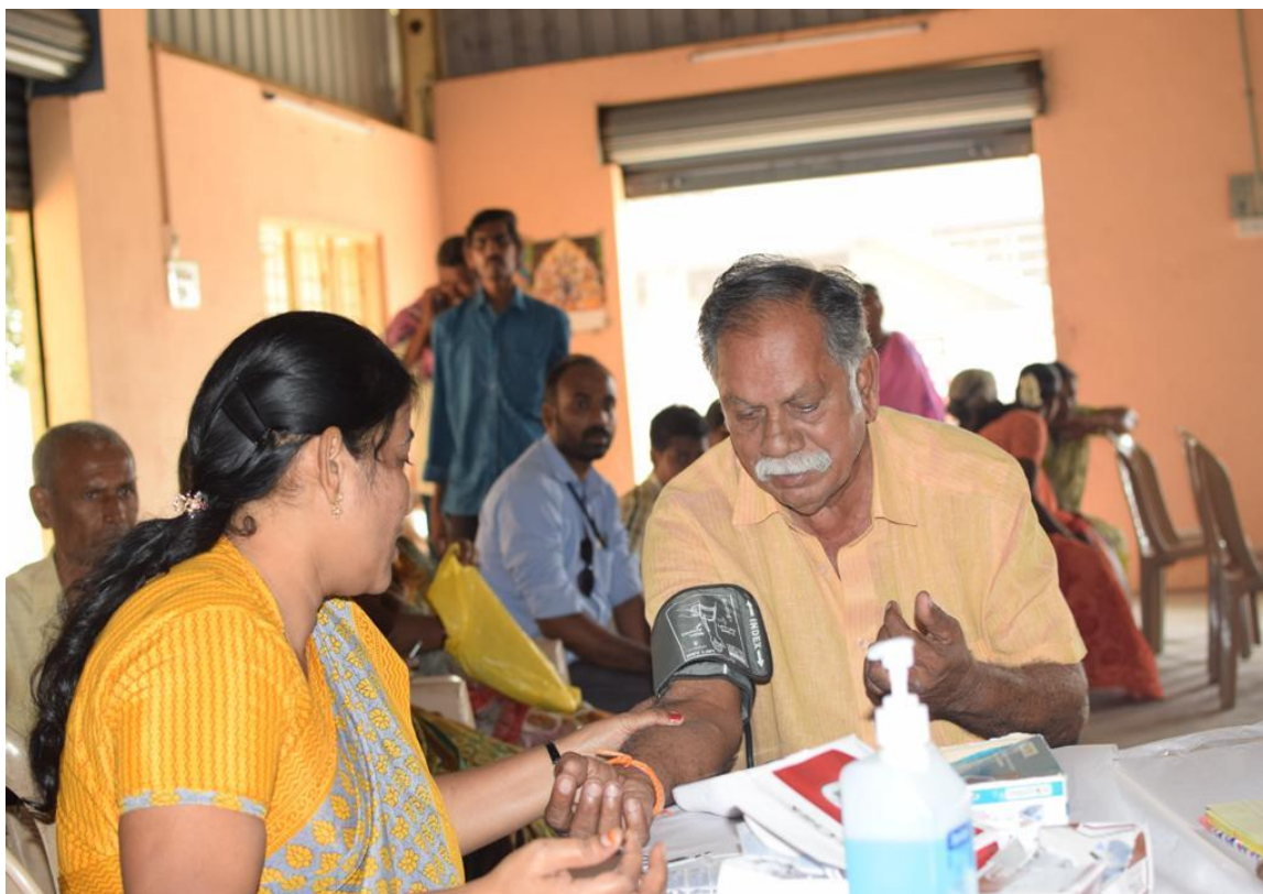
Medicines are provided free of cost