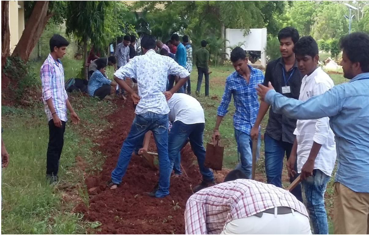
Volunteers digging pits for flower plants