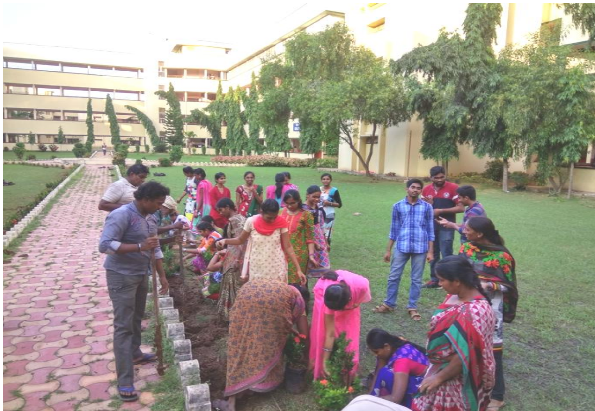
Exuberant volunteers in plantation programme