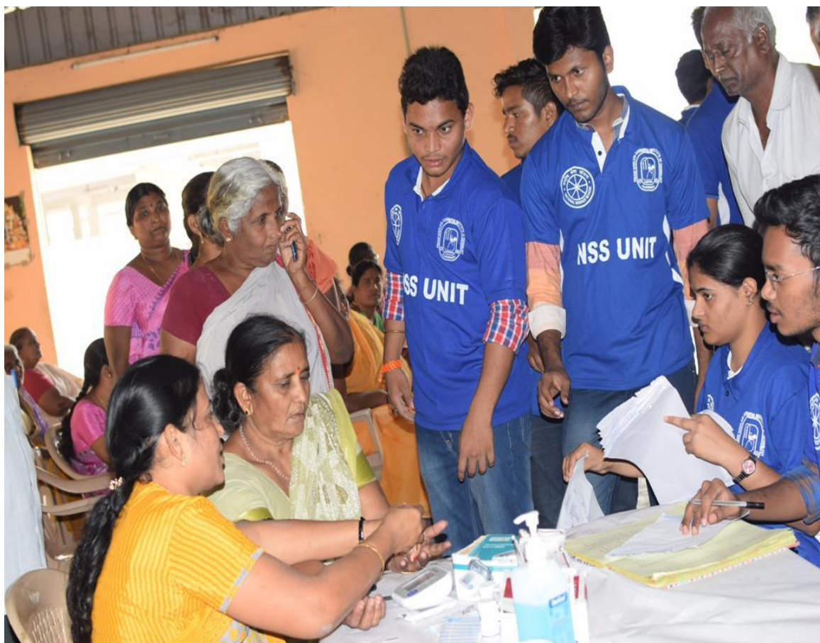
Doctors conducting tests for the needy