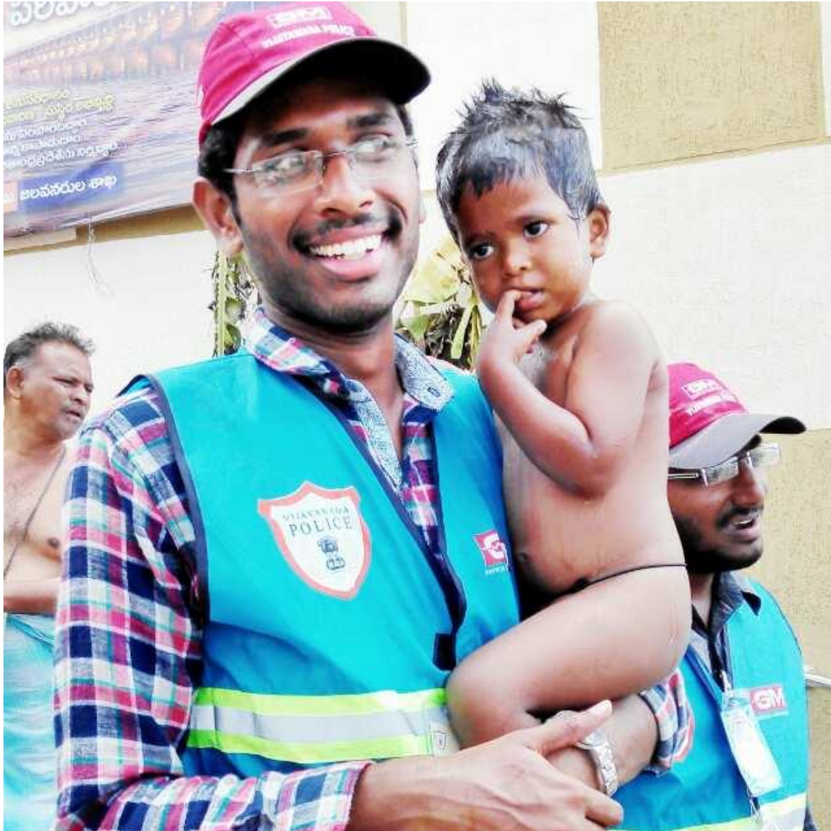
Volunteers taking a child for pushkar bath

A total of 305 student volunteers and 25 staff in-charges have enrolled themselves as Pushkar Volunteers for Krishna Pushkar organised during 12-23 August 2016. They have been allotted duties at Durga Ghat and Durga Temple. They have offered priceless and valuable services like tagging the children, taking the elders for Pushkar bath, distributing water and buttermilk packets, controlling the thronging mob, finding the lost children and elders, providing all sorts of assistance, besides assisting the Police and Revenue Departments.