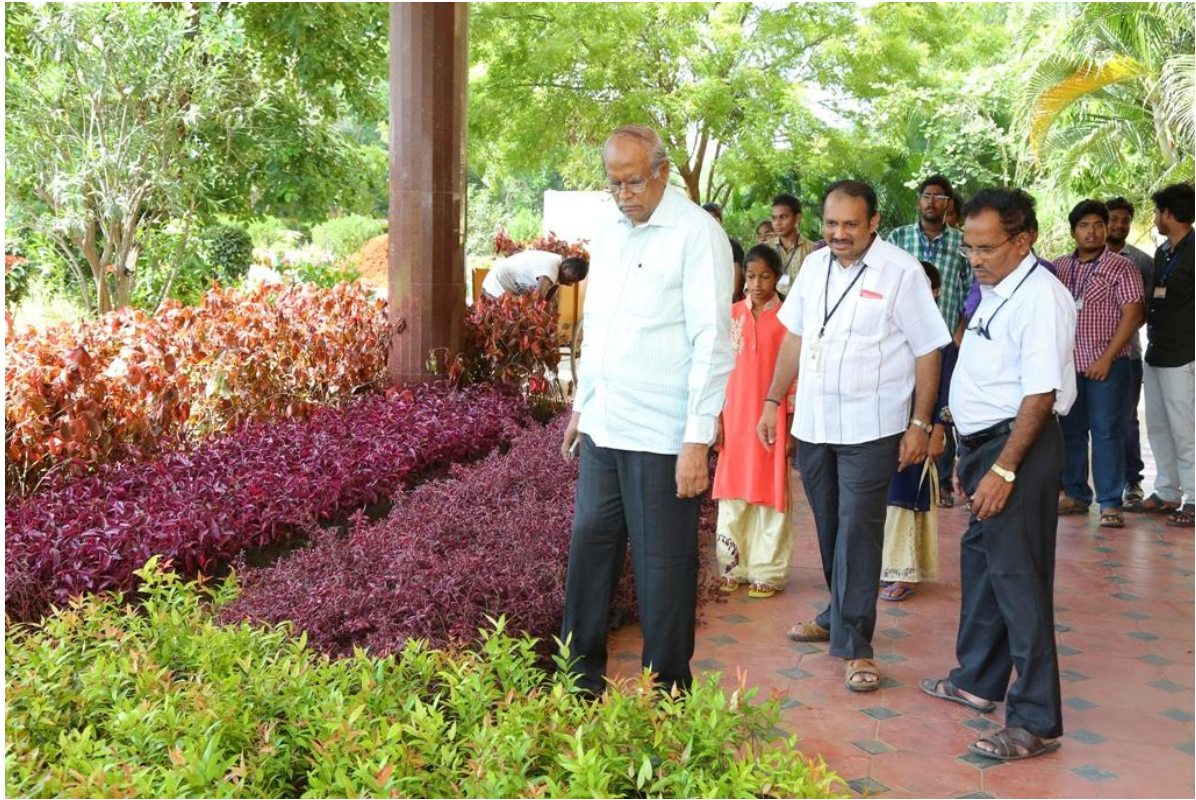
Chief guest distributing the saplings to the volunteers