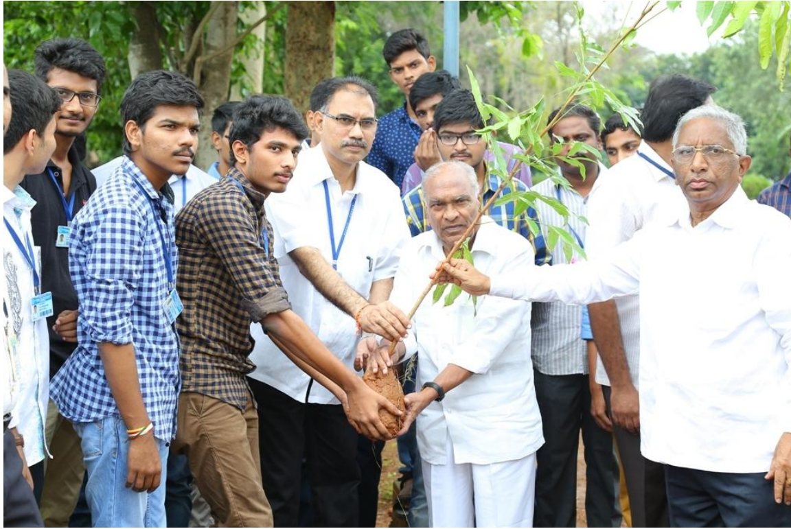
Convenor, Principal and guests with student volunteers