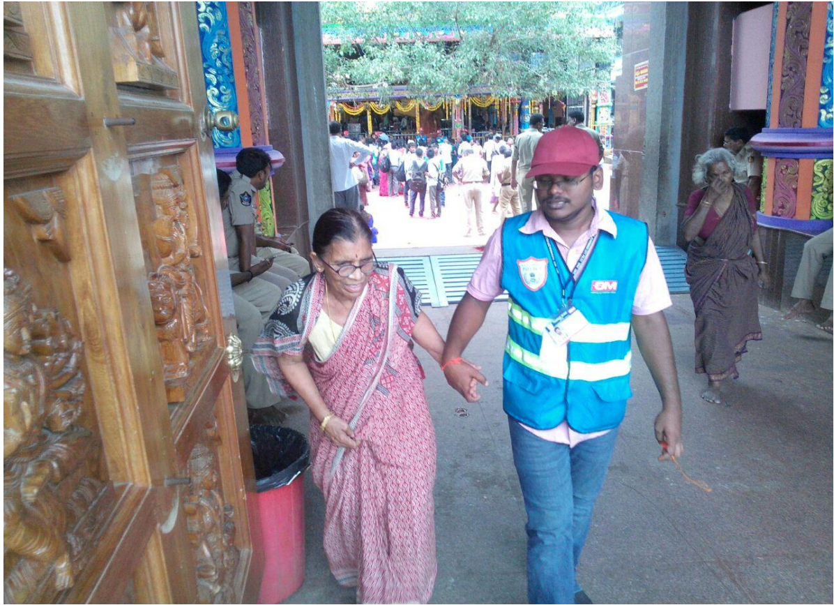
Volunteers helping and nursing the elders