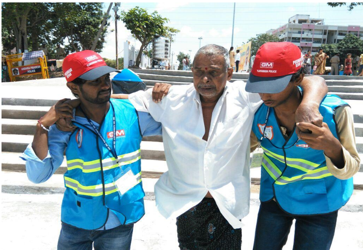
Not me-But you: the NSS motto...coming alive here