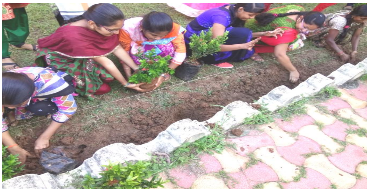
Volunteers planting saplings

100 NSS volunteers of PVP Siddhartha Institute of Technology have participated in Plantation Programme in the premises of our institution on 15-07-2016. Around 220 flower plants have been planted in the event.