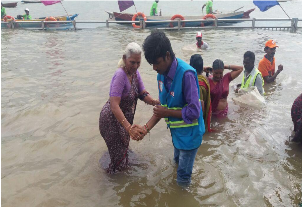
Volunteers helping the elders in taking pushkar bath