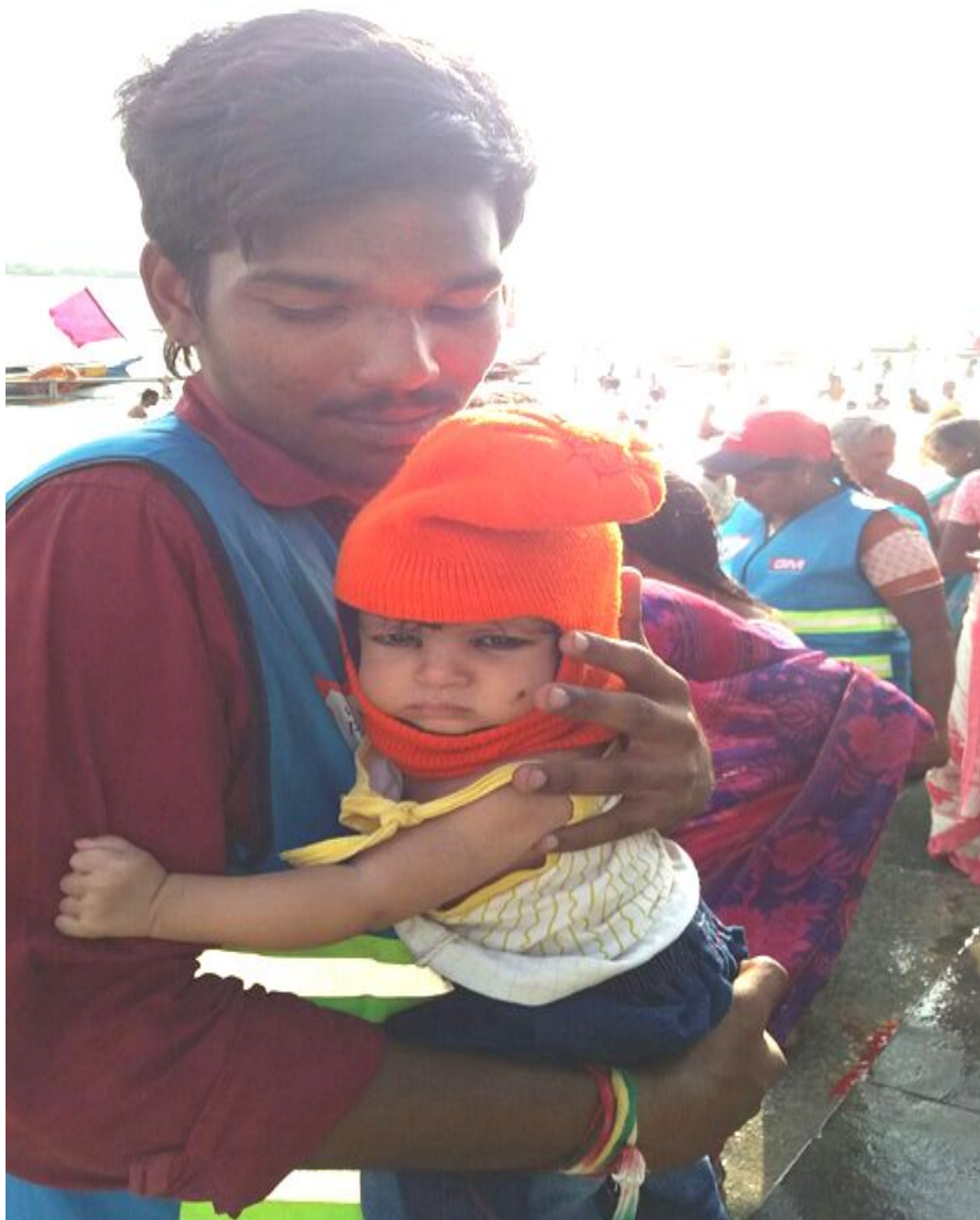
Our volunteer holding a baby..letting her parents take the holy dip