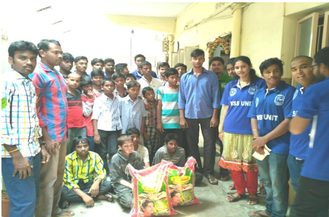
Volunteers at the orphanage