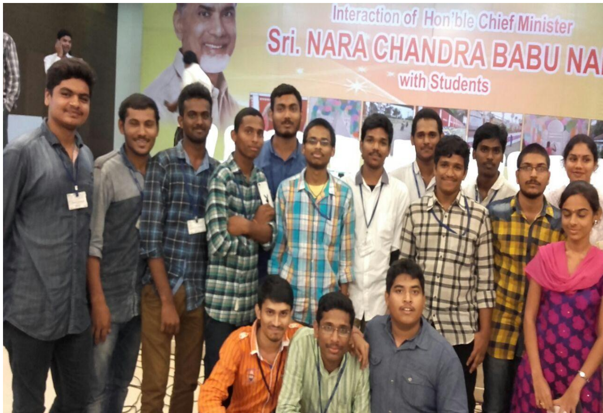
Volunteers at the venue