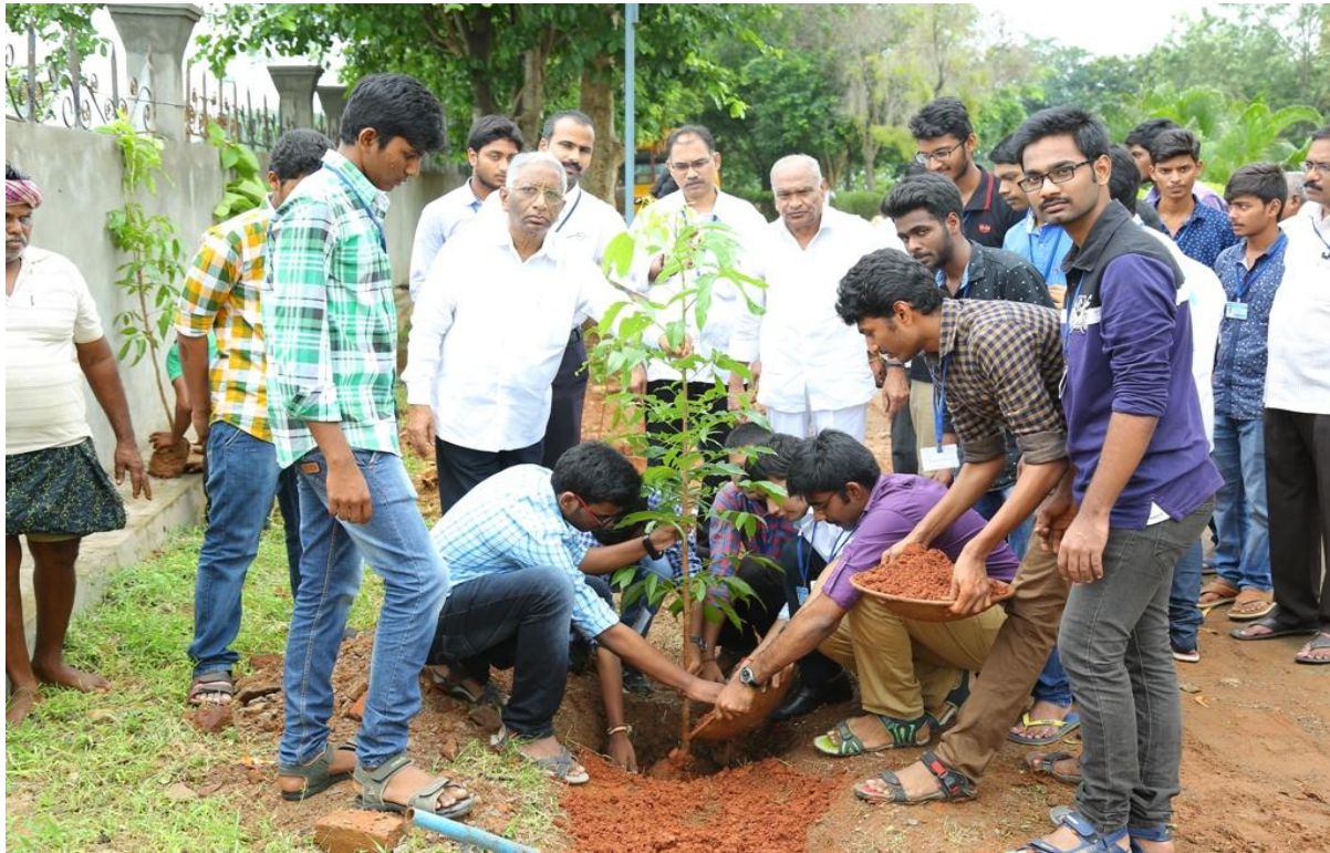
Volunteers planting saplings