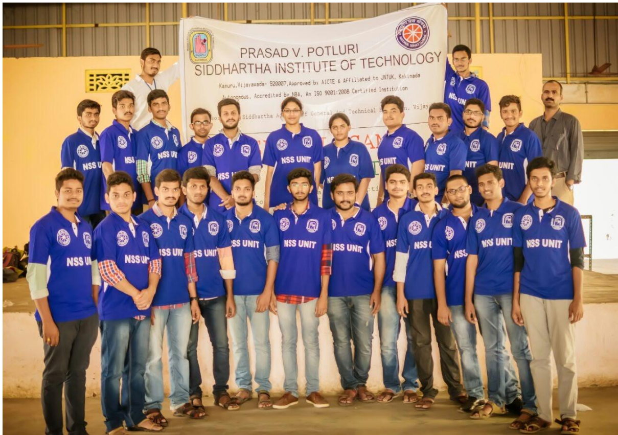
The budding NSS Volunteers who organised the camp