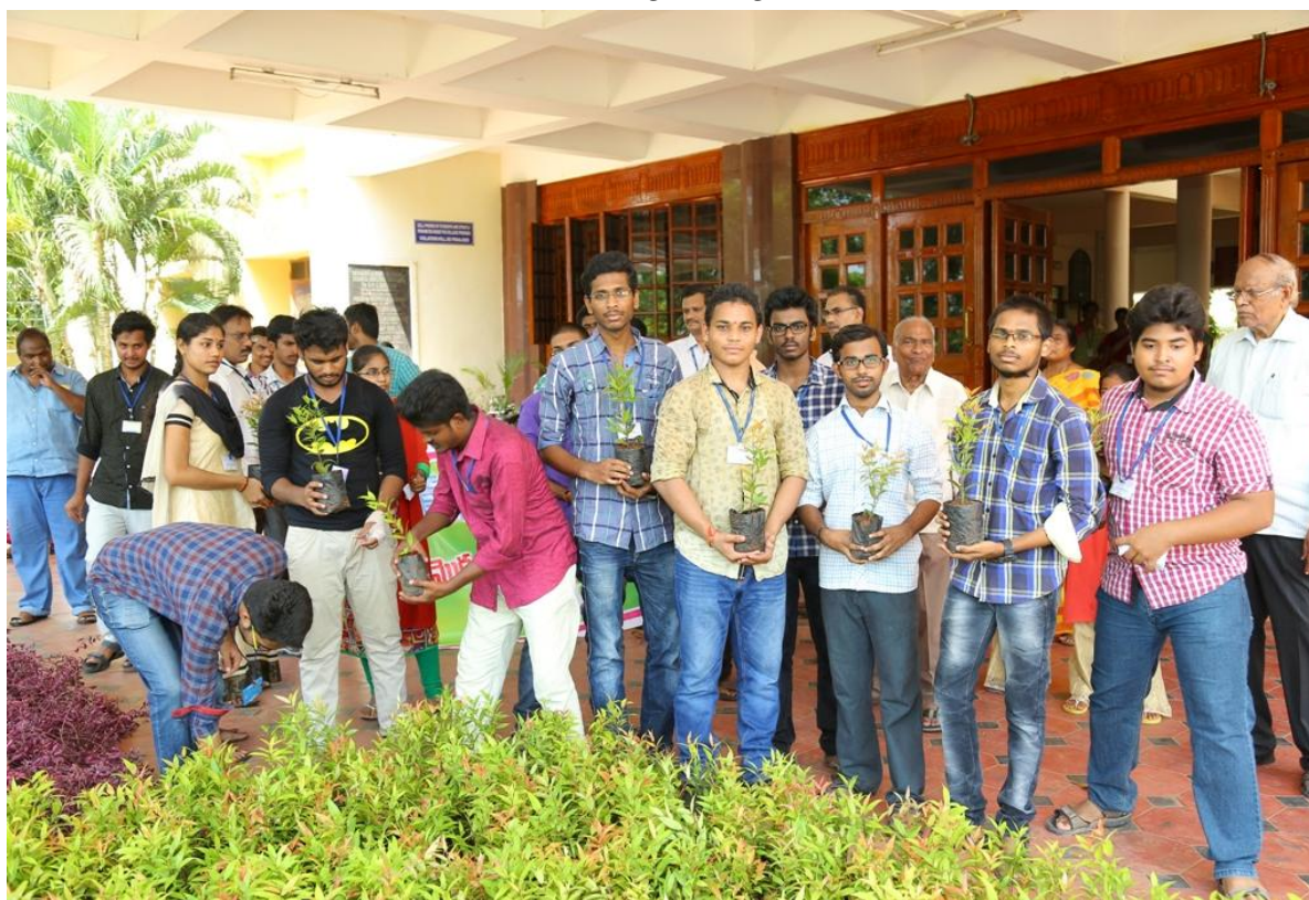
Volunteers getting ready for the programme