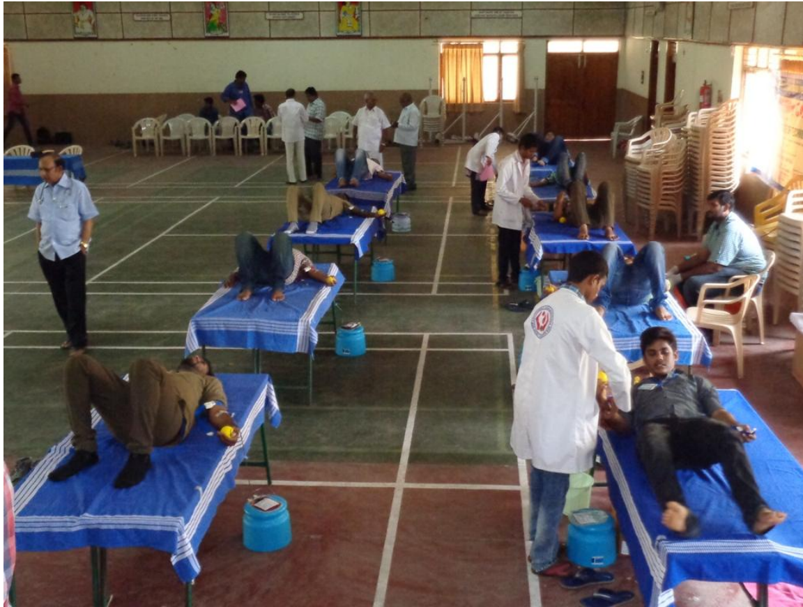
155 students donated blood in the camp