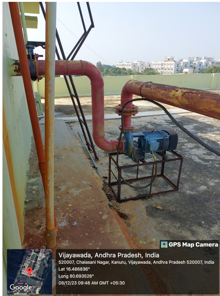
Regulation of water distribution system