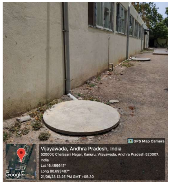
Rain water harvesting through recharge pits