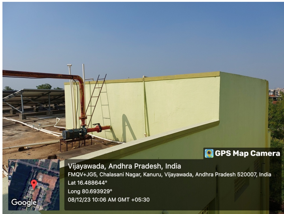
TWO MAJOR WATER TANKS FOR THE STORAGE OF WATER