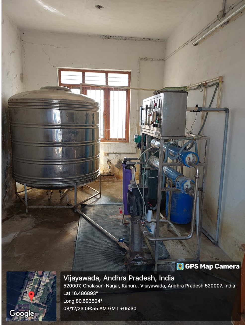
RO System and purified water distribution in the campus