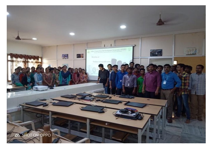
Fig1: Training Program on "Problem Solving Skills using C"

The Department of CSE has organized 6-Days Training Program on "Problem Solving Skills using C" for I B.Tech Students in association with APSSDC at PVPSIT held on 07-01-2019 to 12-01-2019.