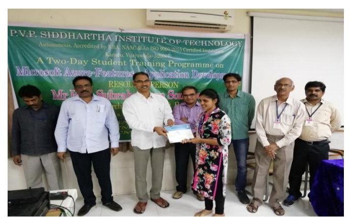
Fig 3: Training Program on "Microsoft Azure Feature and its Applications