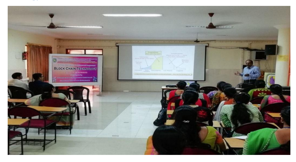
Fig5: Three day FDP on Block Chain Technology