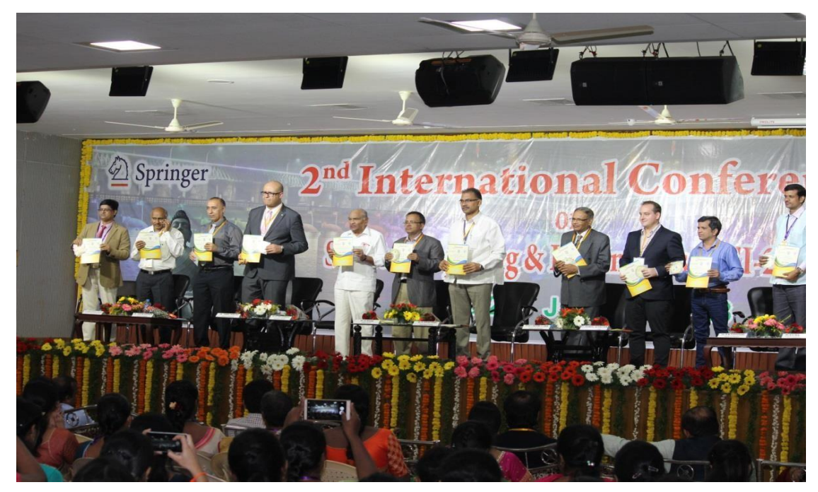
Fig1: 2<sup>nd</sup> International Conference on Smart Computing & Informatics

1. The Department of CSE & IT has organized "2<sup>nd</sup> International Conference on Smart Computing & Informatics (SCI-2018), Springer SIST Series from 27-28 Jan'18.