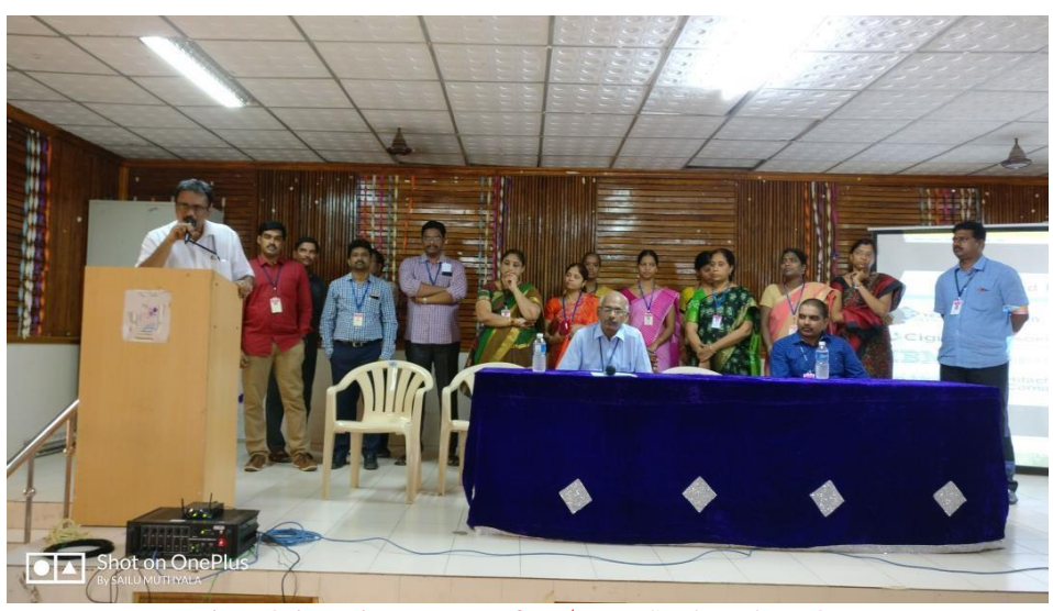
Fig7: Orientation program for Ist Year Students by HOD