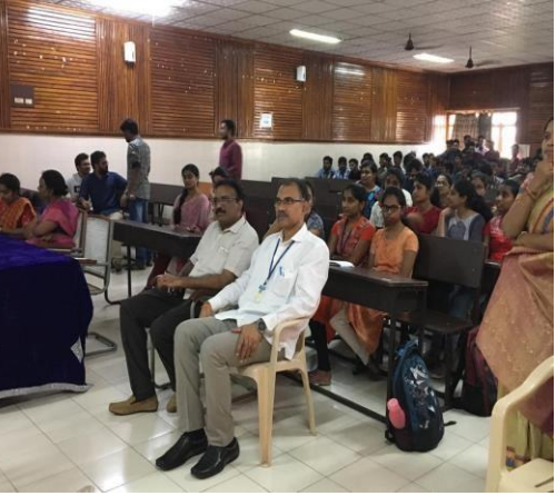
Fig.7: Cultural Events organized by CSE Department