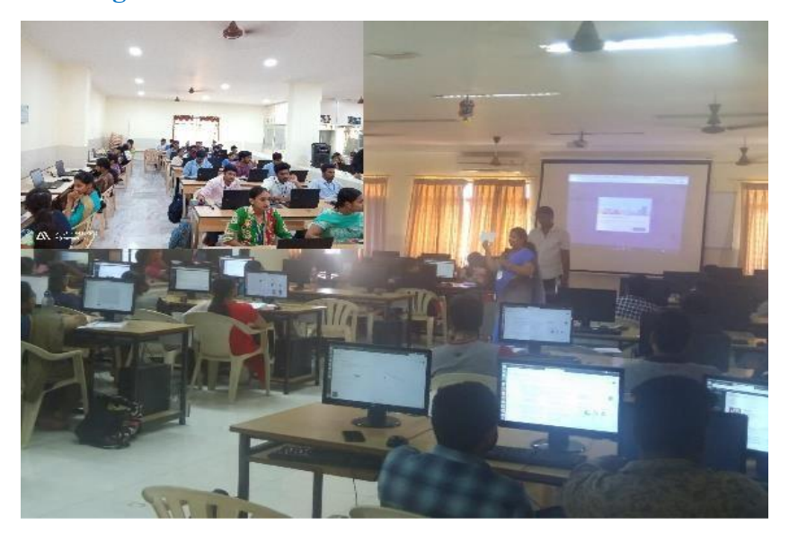
Fig 3: Workshop on "Indian Game Development Challenge"

The department of CSE has organized Thirty Days Workshop on "Indian Game Development Challenge" from 27-08-2018 to 28-09-2018.