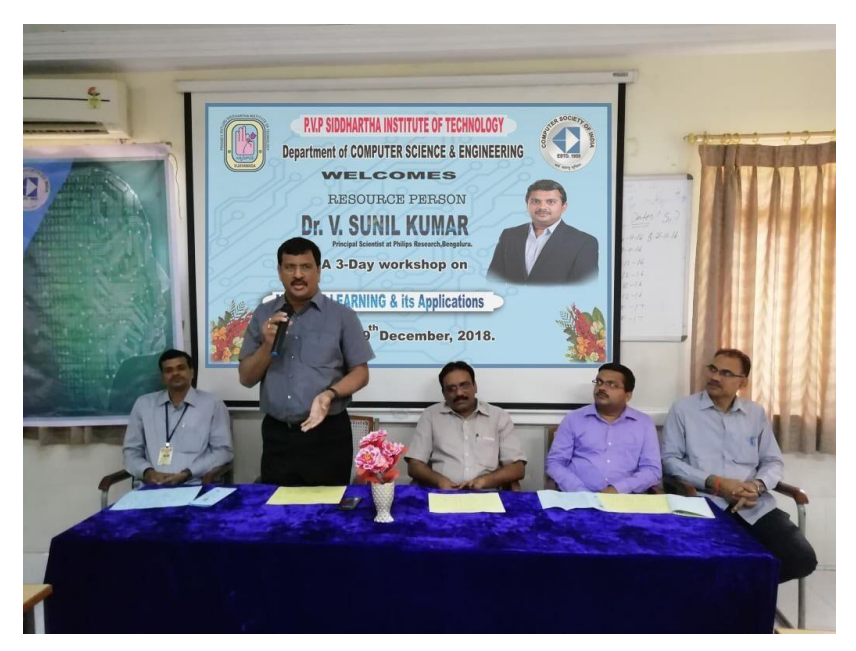
Fig.6: Workshop on "Machine Learning and its Applications"

15. The Department of Computer Science & Engineering has organized cultural events for B.Tech CSE students as a part of the weekend cultural program, on 22<sup>nd</sup> December, 2018.