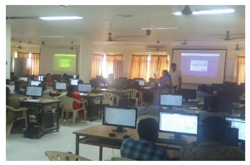
Fig.4: Two Day Workshop on "Digital Marketing"Resource Person: S.Siva Lalitha, CEO, Hyper Techno Solutions Vijayawada62 students of CSE Department have participated in the workshop.

The department of CSE has organized Two Day Workshop on "Digital Marketing" from 28-9-2018 to 29-9-2018.