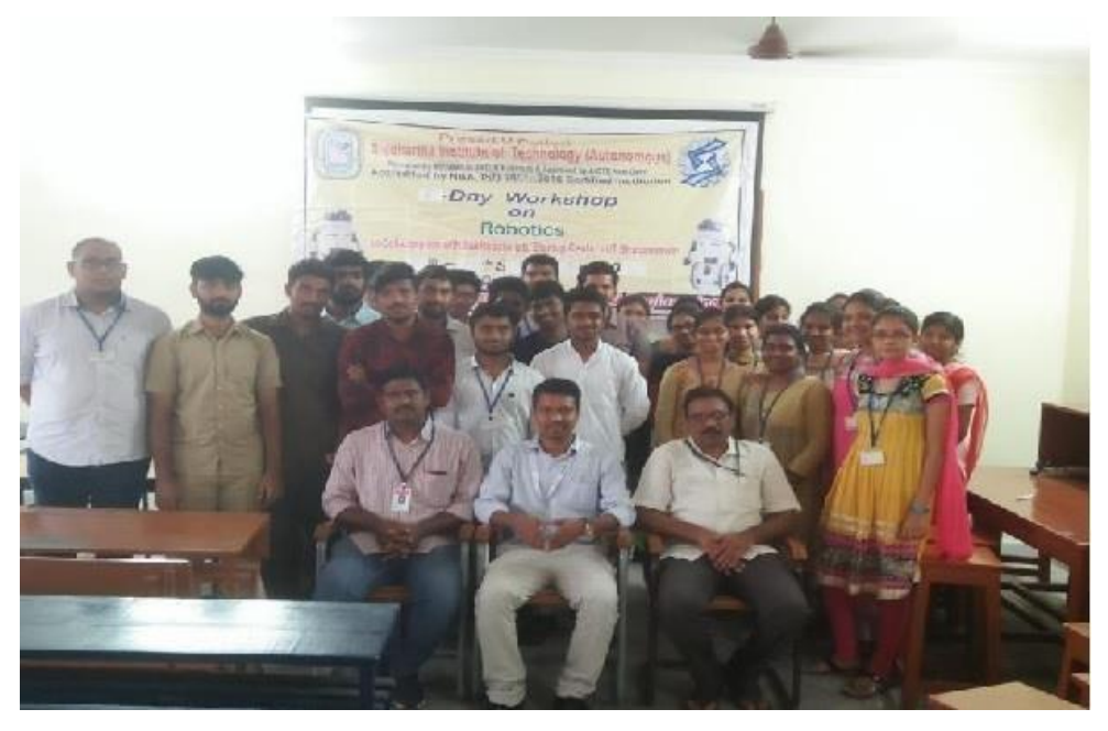
Fig 1: Two Day Student Training Program on "Hands on-Robotic Applications "